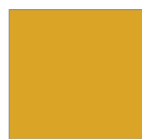
38 Or Gold