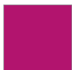
31 Vieux rose Old Pink