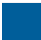
37 Bleu cobalt Cobalt Blue