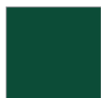
35 Vert foncé Dark Green