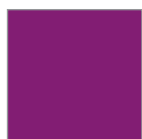
33 Parme Parma