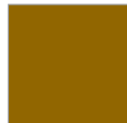
30 Sable Sand