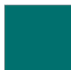
13 Émeraude Emerald