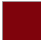
26 Pourpre Purple