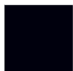
15 Noir Black