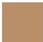
48 Or chaud Warm Gold