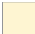
39 Nacré Pearl