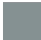
47 Étain Pewter