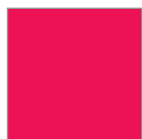
45 Rouge Red