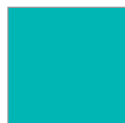
43 Bleu océan Ocean Blue